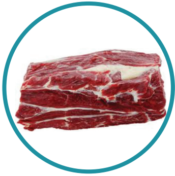
Chuck & Blade