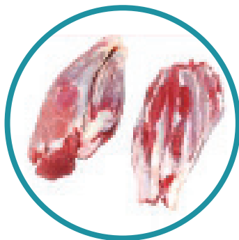
Shin & Shank